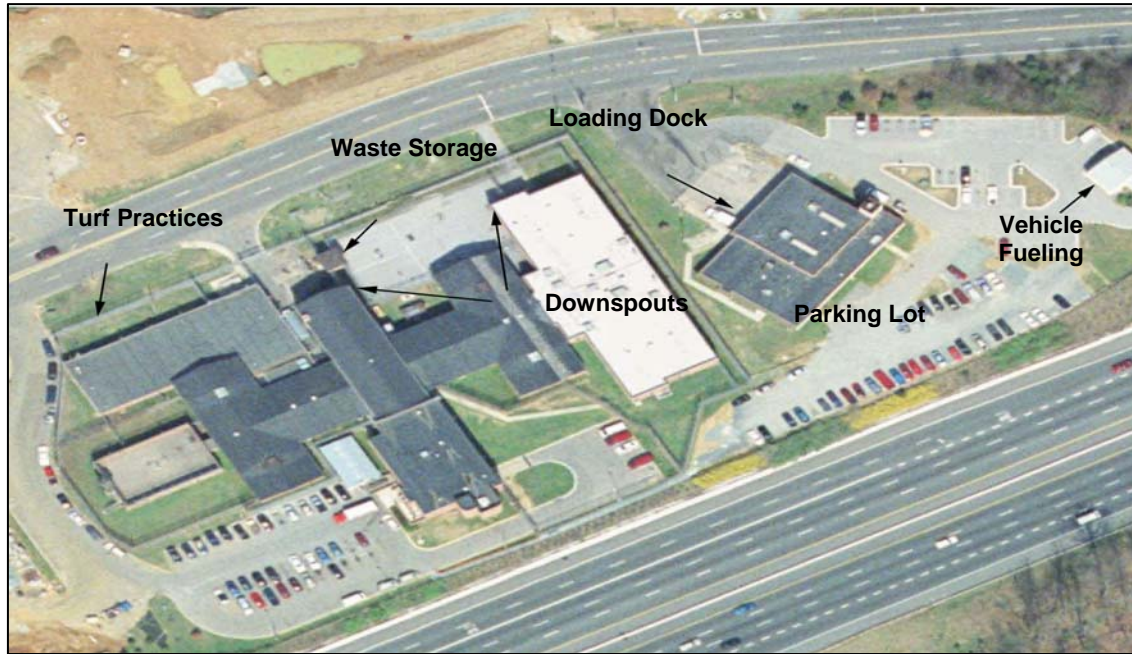
Figure 2: Potential Pollutant Sites

Pollution prevention could be organized by type of pollutant (such as fertilizer use), by type of practice (such as sweeping) or by land use. For this manual, the consultant team has elected to present pollution prevention techniques as sets of practices organized by land use: residential, commercial/industrial, and municipal. The result is three fact sheets, contained in Appendix A, that are aimed at instructing property managers of all the practices they should incorporate into their property maintenance routines.