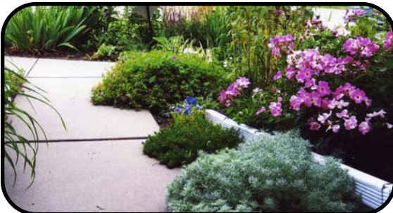
A downspout directing water to a garden.

Local agencies now offer cost-share programs to help pay for water resources projects of all sizes. It is now even easier to stop stormwater runoff! See back panel for a list of programs.