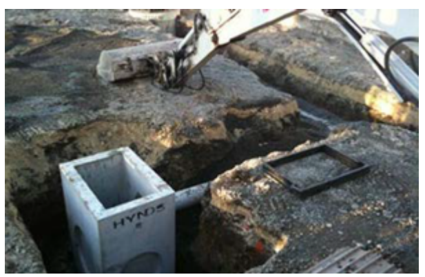
Sumps allow solids to settle at the bottom.

Schematic of a catch basin. Stormwater enters through the grate or inflow pipe and larger solids settle out at the bottom of the basin.