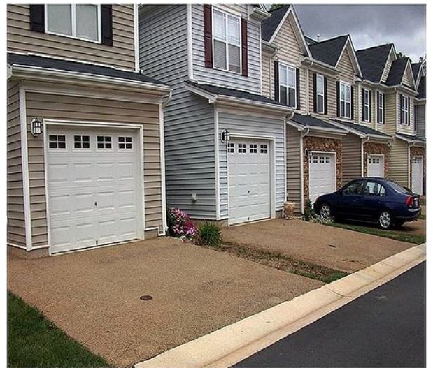
Photo illustrating pervious concrete. Pervious concrete is a special type of concrete with a high porosity that allows water from precipitation and other sources to pass directly through.

The most commonly used permeable pavement surfaces are pervious concrete, porous asphalt, and permeable interlocking concrete pavers. Other options include plastic and concrete grids, as well as amended soils (artificial media added to soil to maintain soil structure and prevent compaction) (MPCA 2008). This document focuses on pervious concrete, porous asphalt and permeable interlocking concrete pavements. A general comparison of their properties is provided in the table below. Additional requirements specific to each system should be obtained by designers from suppliers and from the local review authority.