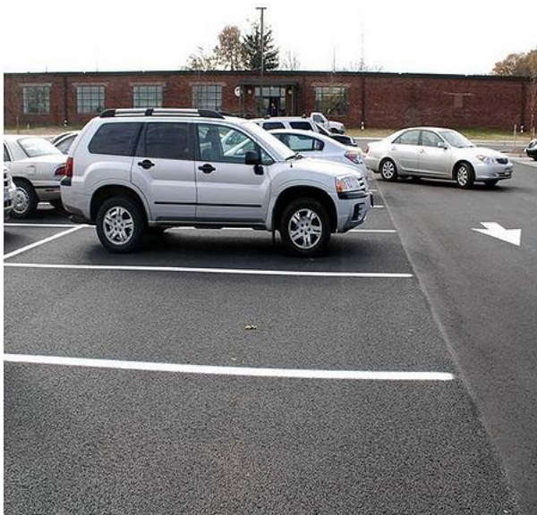
Photo illustrating porous asphalt. Porous asphalt is standard hot-mix asphalt that allows water to drain through it.