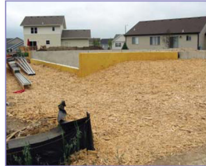
Wood mulch from lumber waste covers bare ground.

◆ Use straw or wood mulch, compost, hydroseeding, or RECPs when temporary seeding is not practical. Mulch can be utilized in any weather at any time.