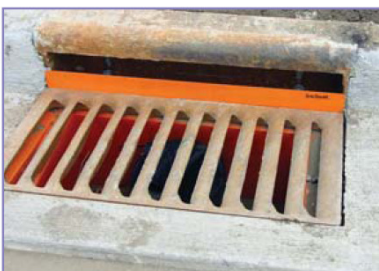
A street view and the inside of one type of inlet protection device.

Special care should be given to street inlets, as they are a direct conduit to local waterways. Inlet protection should be the last line of defense for protecting local streams and surface water.