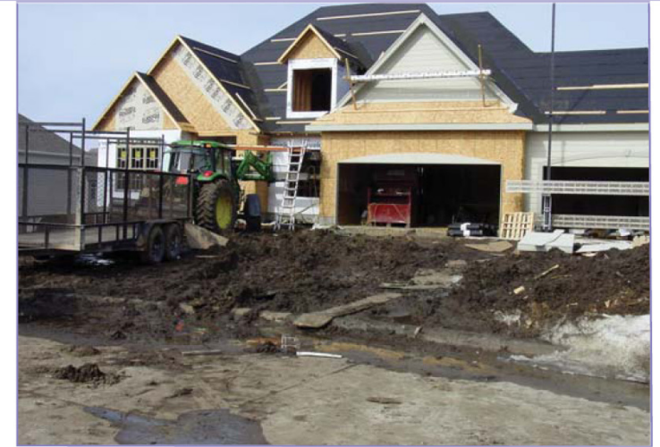
The lack of controls at these individual home sites will result in water quality degradation and may result in compliance violations.