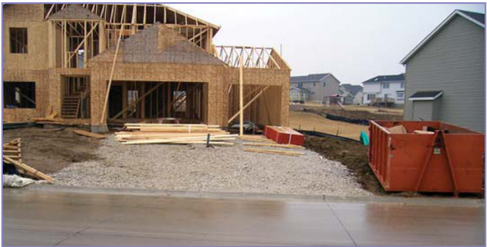
This rock entrance provides mud-free access for construction workers and building materials.

Special care should be given to street inlets, as they are a direct conduit to local waterways. Inlet protection should be the last line of defense for protecting local streams and surface water.