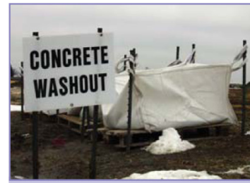
This designated concrete washout keeps pollutants from entering inlets and surface water.

◆ Maintain washout area and dispose of concrete waste on a regular basis.