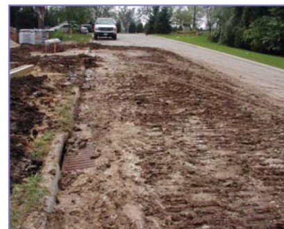
Without a proper entrance, sediment was tracked into the street and inlets carry sediment to the river.

◆ Immediately clean up tracking in streets with brooms, shovels, or a skid loader. Do not use water to clean pavements.