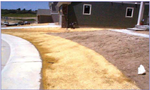
This rolled erosion control product (RECP) is used to prevent erosion and keep the streets clean while homes are being built. A sediment barrier is needed until vegetative cover is established.